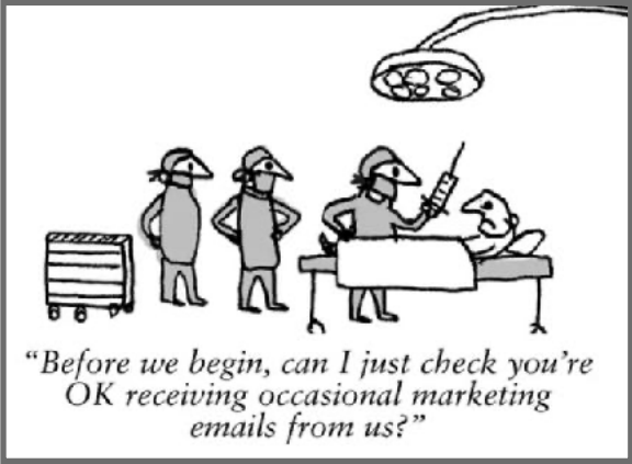
"Before we begin, can I just check you're OK receiving occasional marketing emails from us?"