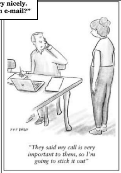
"They said my call is very important to them, so I'm going to stick it out"