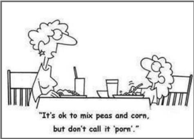
"It's ok to mix peas and corn, but don't call it 'porn'."

Diet tip: If you think you're hungry, you might just be thirsty. Have a bottle of wine first and then see how you feel.