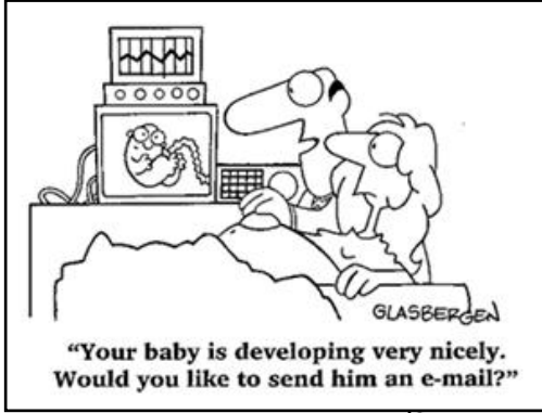
"Your baby is developing very nicely. Would you like to send him an e-mail?"