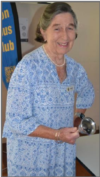
Above: The 'Chief' calling us all to order.